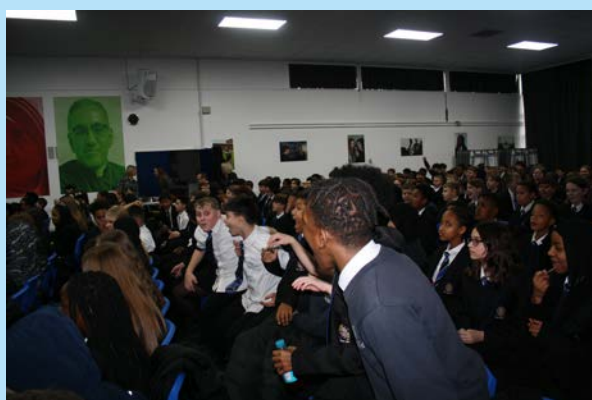
Above : The crowd enjoying