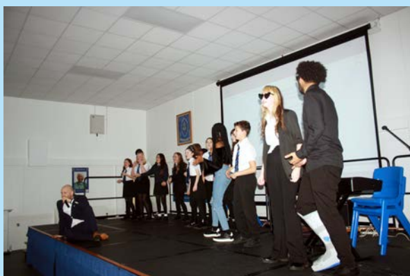
Above : The finale - Merry Christmas Everyone