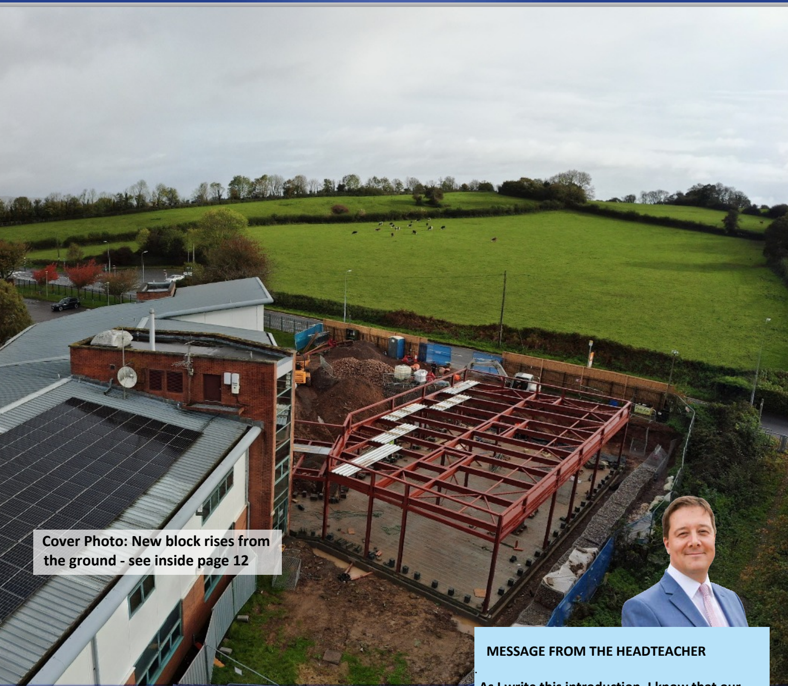
Cover Photo: New block rises from the ground - see inside page 12