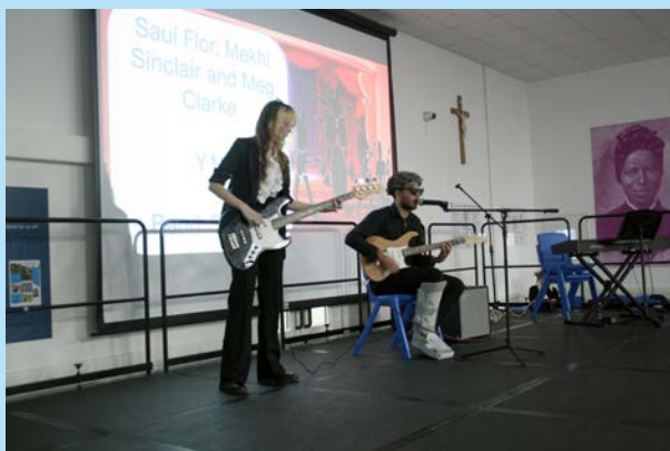
Above : Oreo