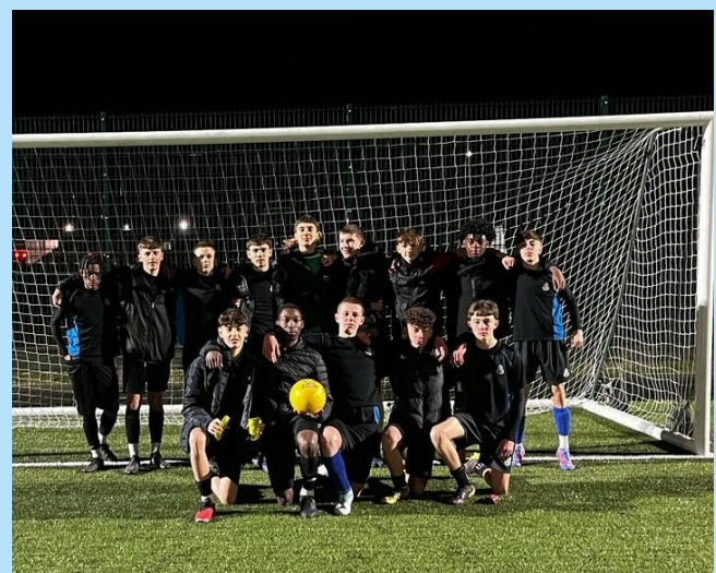
Above : Year 11 Boys football team